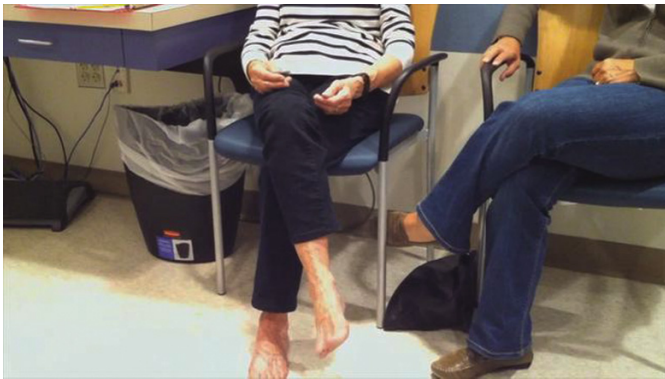
Video 1. Choreiform movements involving both upper and lower limb, predominantly on the right side.

In this communication, we report another patient with chorea and high titers of aPL antibodies who does not fulfill the criteria for APS. The literature on aPL antibody titers, pathophysiology, neuroimaging, and treatment is also reviewed.